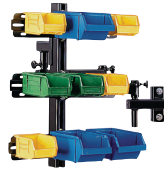
3 Arm Steel Adjustable Bin Racks 24" H x 18" W