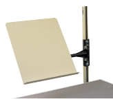
Document Stand. 19" W x 17" H: 90° Tilt, from Flat to Vertical.

Easily fasten to vertical columns of Jib Kit and Twin Bench Rail Kits. #18" Arms swing 170° where you need them, lock easily in place. Fit standard 1 1/2" x 1 1/2" rails (Superstrut, Unistrut, B-line, etc.) Rugged steel construction. All mounting hardware included.