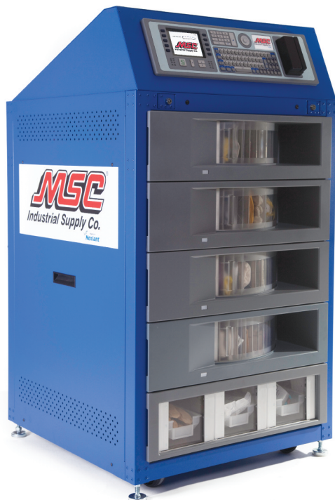
500e Vending System